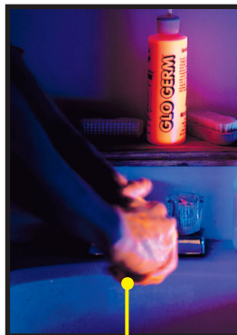
After being washed, they are placed under a black light again.