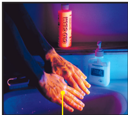
When placed under a black light, hands covered in Glo Germ oil glow a brilliant orange.