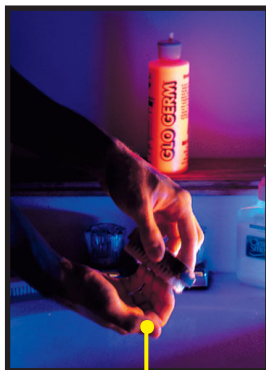
Using plenty of soap and a scrub brush—hands are washed.