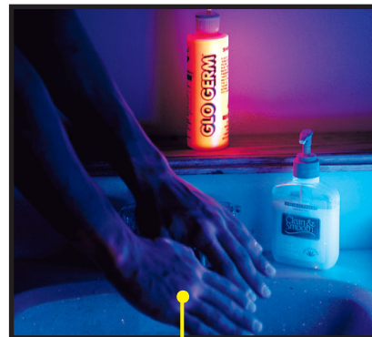
It is evident where they were not washed properly—most commonly missed areas are around the fingernails and between the fingers.

fluorescers. Because all clothing contains residual detergent, some types of clothing may appear to be especially brilliant in bright sunshine, which is more than 10% UV light.