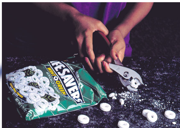
When you crush a Wint-O-Green Lifesaver, it gives off a burst of blue light. You can see this demonstration of triboluminescence only if you first let your eyes adapt to a dark room.

visible light that you see. Without this phosphor coating, the lamp would emit harmful short-wave UV light.